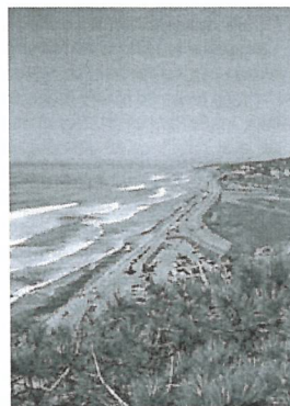
The Pacific Ocean and the southern California coast

The deadline for registration is October 14, 2011.